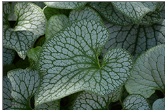
Sterling Silver Bugloss foliage

Sterling Silver Bugloss will grow to be about 12 inches tall at maturity, with a spread of 24 inches. When grown in masses or used as a bedding plant, individual plants should be spaced approximately 20 inches apart. It grows at a medium rate, and under ideal conditions can be expected to live for approximately 10 years. As an herbaceous perennial, this plant will usually die back to the crown each winter, and will regrow from the base each spring. Be careful not to disturb the crown in late winter when it may not be readily seen!