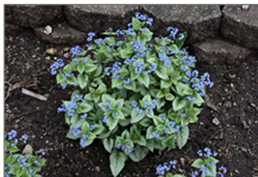
Sterling Silver Bugloss in bloom