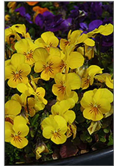
Penny Yellow Pansy flowers

This plant will require occasional maintenance and upkeep, and should only be pruned after flowering to avoid removing any of the current season's flowers. Deer don't particularly care for this plant and will usually leave it alone in favor of tastier treats. Gardeners should be aware of the following characteristic(s) that may warrant special consideration;