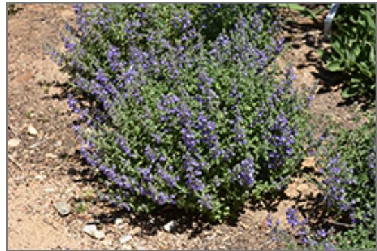
Sylvester Blue Catmint in bloom

Sylvester Blue Catmint is recommended for the following landscape applications;