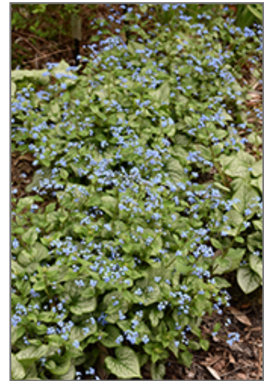
Jack Frost Bugloss in bloom

Jack Frost Bugloss will grow to be about 12 inches tall at maturity extending to 16 inches tall with the flowers, with a spread of 18 inches. When grown in masses or used as a bedding plant, individual plants should be spaced approximately 14 inches apart. It grows at a medium rate, and under ideal conditions can be expected to live for approximately 10 years. As an herbaceous perennial, this plant will usually die back to the crown each winter, and will regrow from the base each spring. Be careful not to disturb the crown in late winter when it may not be readily seen!