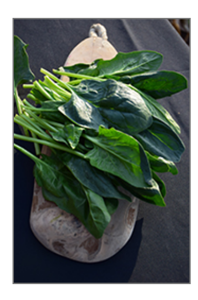
Spinach fruit

Spinach will grow to be about 12 inches tall at maturity, with a spread of 12 inches. This fast-growing vegetable plant is an annual, which means that it will grow for one season in your garden and then die after producing a crop.