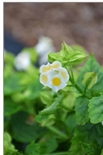
Kauai Lemon Drop Torenia flowers

Kauai Lemon Drop Torenia is recommended for the following landscape applications;