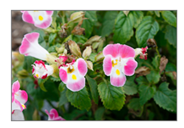
Kauai Rose Torenia flowers