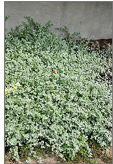
Silver Licorice Plant

Silver Licorice Plant is a fine choice for the garden, but it is also a good selection for planting in outdoor containers and hanging baskets. Because of its trailing habit of growth, it is ideally suited for use as a 'spiller' in the 'spiller-thriller-filler' container combination; plant it near the edges where it can spill gracefully over the pot. Note that when growing plants in outdoor containers and baskets, they may require more frequent waterings than they would in the yard or garden.