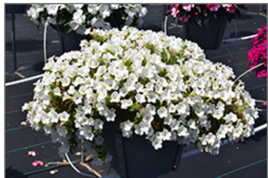
Itsy White Petunia in bloom