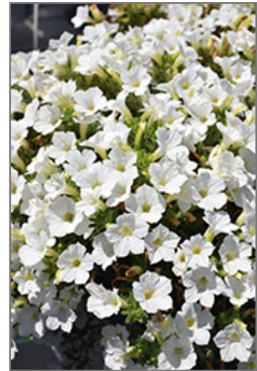
Itsy White Petunia flowers

Itsy White Petunia is a dense herbaceous annual with a trailing habit of growth, eventually spilling over the edges of hanging baskets and containers. Its medium texture blends into the garden, but can always be balanced by a couple of finer or coarser plants for an effective composition.