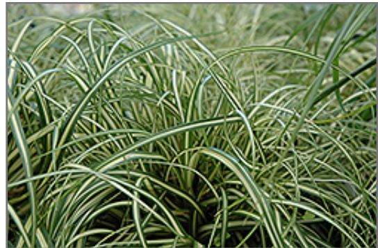
Evergold Variegated Japanese Sedge foliage

Evergold Variegated Japanese Sedge is recommended for the following landscape applications;