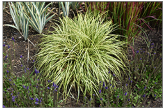
Evergold Variegated Japanese Sedge foliage

Evergold Variegated Japanese Sedge will grow to be about 8 inches tall at maturity, with a spread of 12 inches. Its foliage tends to remain low and dense right to the ground. It grows at a medium rate, and under ideal conditions can be expected to live for approximately 10 years. As an evergreen perennial, this plant will typically keep its form and foliage year-round.