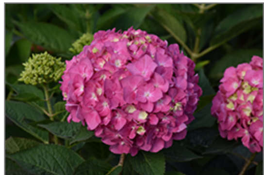
Let's Dance Arriba! Hydrangea flowers