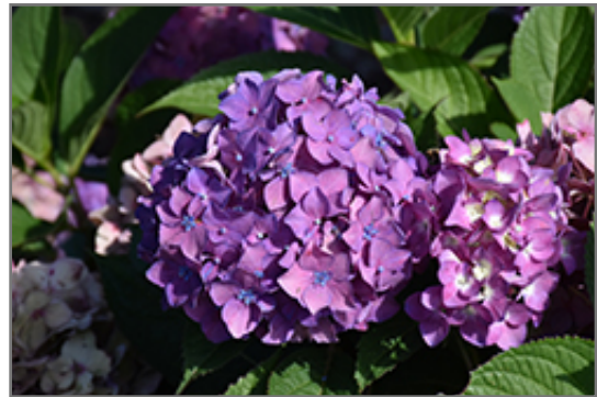
Let's Dance Arriba! Hydrangea flowers

Let's Dance Arriba! Hydrangea is recommended for the following landscape applications;