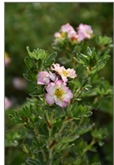
Happy Face Hearts Potentilla flowers