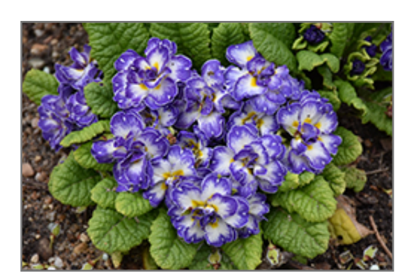
BELARINA Blue Ripples Primrose in bloom

An outstanding selection from a refined series, with large, fragrant, violet and white double flowers with white edges; compact mounded, green foliage; hardy and prefers sheltered shaded areas and moist soil