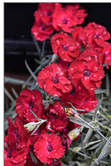
Mountain Frost Red Garnet Pinks flowers