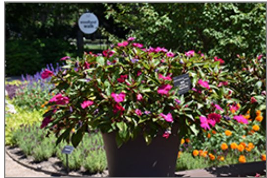
Solarscape Magenta Bliss Impatiens in bloom

Solarscape Magenta Bliss Impatiens will grow to be about 9 inches tall at maturity, with a spread of 20 inches. When grown in masses or used as a bedding plant, individual plants should be spaced approximately 14 inches apart. Its foliage tends to remain low and dense right to the ground. This fast-growing annual will normally live for one full growing season, needing replacement the following year.