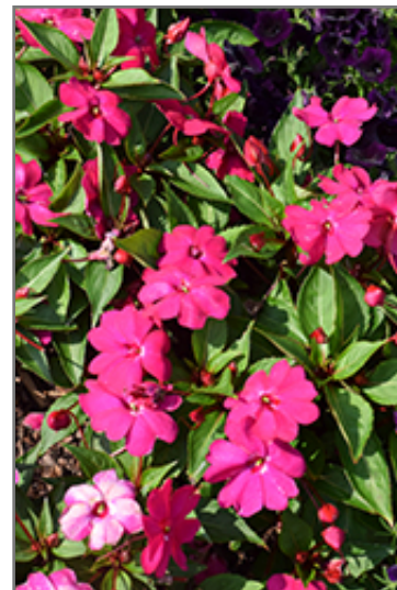
Solarscape Magenta Bliss Impatiens flowers

Solarscape Magenta Bliss Impatiens is recommended for the following landscape applications;