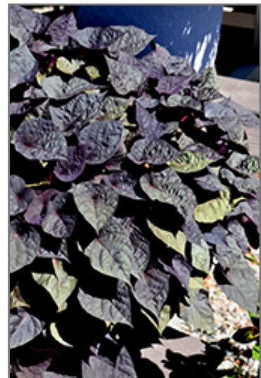
Spotlight Black Heart Sweet Potato Vine foliage