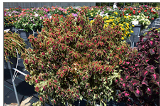
TrailBlazer Glory Road Coleus