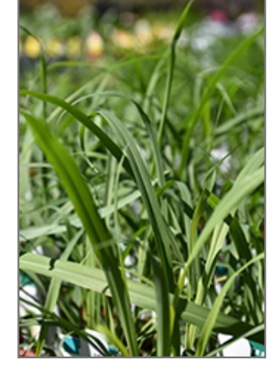
Lemon Grass foliage