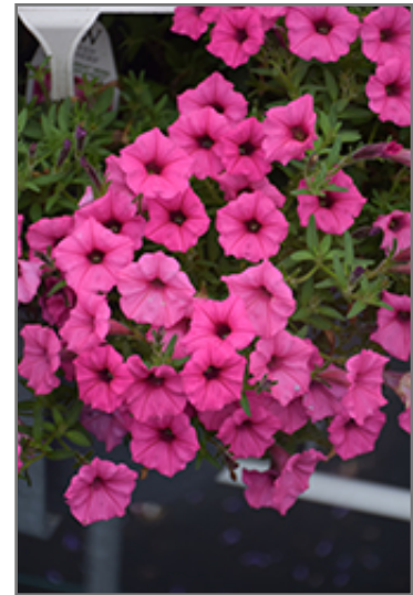
Supertunia Mini Vista Hot Pink Petunia flowers

Supertunia Mini Vista Hot Pink Petunia is recommended for the following landscape applications;