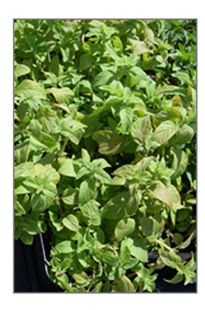
Banana Mint