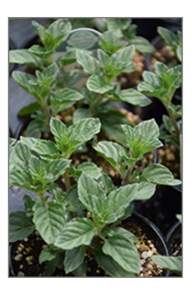
Jessica's Sweet Pear Mint foliage