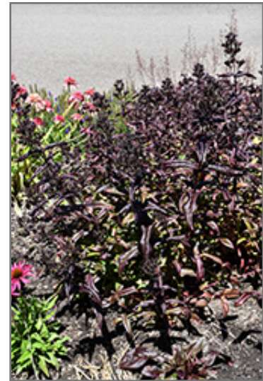
Dakota Burgundy Beard Tongue

Dakota Burgundy Beard Tongue is a fine choice for the garden, but it is also a good selection for planting in outdoor pots and containers. With its upright habit of growth, it is best suited for use as a 'thriller' in the 'spiller-thriller-filler' container combination; plant it near the center of the pot, surrounded by smaller plants and those that spill over the edges. Note that when growing plants in outdoor containers and baskets, they may require more frequent waterings than they would in the yard or garden.