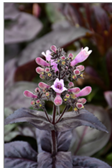
Dakota Burgundy Beard Tongue flowers

Dakota Burgundy Beard Tongue is an herbaceous perennial with an upright spreading habit of growth. Its medium texture blends into the garden, but can always be balanced by a couple of finer or coarser plants for an effective composition.