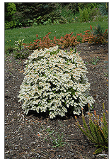
Prelude Japanese Pieris in bloom