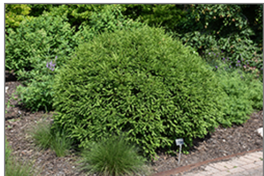
Green Gem Boxwood