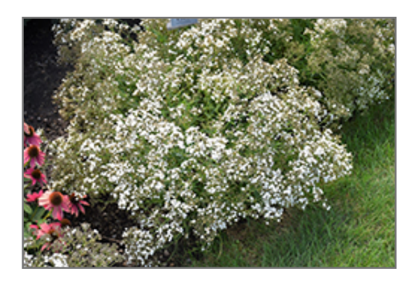
Festival Star Baby's Breath in bloom