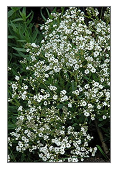
Festival Star Baby's Breath flowers