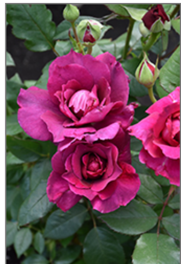
Intrigue Rose flowers