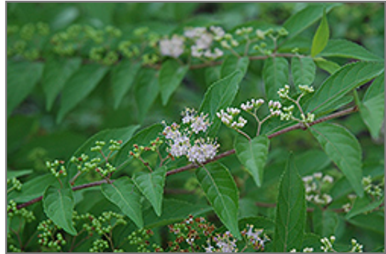
Issai Beautyberry flowers

Issai Beautyberry will grow to be about 4 feet tall at maturity, with a spread of 5 feet. It tends to fill out right to the ground and therefore doesn't necessarily require facer plants in front. It grows at a fast rate, and under ideal conditions can be expected to live for approximately 20 years.