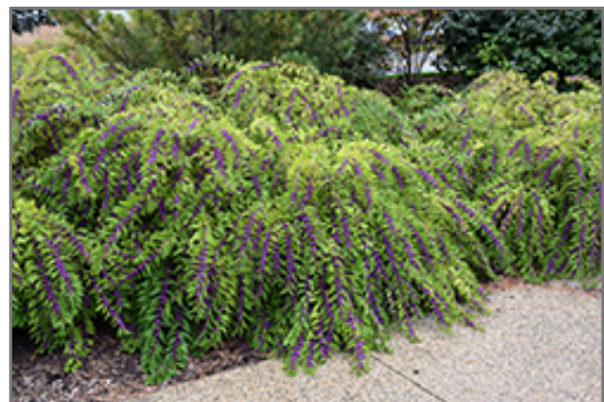
Issai Beautyberry fruit