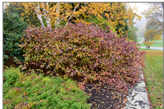
Bailey Red-Twig Dogwood in fall