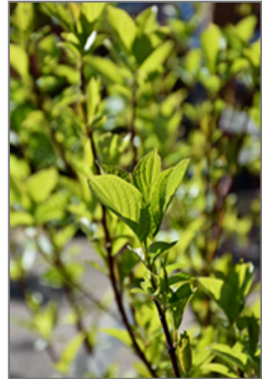
Bailey Red-Twig Dogwood foliage

This shrub does best in full sun to partial shade. It is an amazingly adaptable plant, tolerating both dry conditions and even some standing water. It is not particular as to soil type or pH. It is highly tolerant of urban pollution and will even thrive in inner city environments. This species is native to parts of North America.