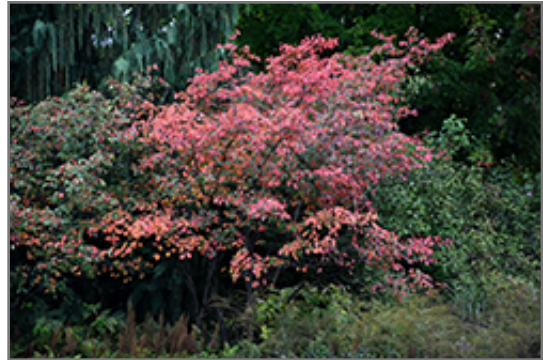
Autumn Brilliance Serviceberry in fall

This tree does best in full sun to partial shade. It prefers to grow in average to moist conditions, and shouldn't be allowed to dry out. It is not particular as to soil type or pH. It is somewhat tolerant of urban pollution. This particular variety is an interspecific hybrid.