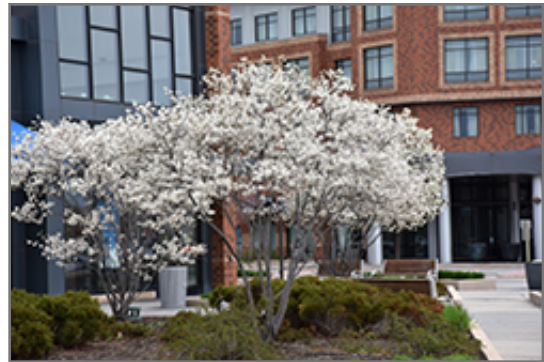
Autumn Brilliance Serviceberry in bloom

Autumn Brilliance Serviceberry is recommended for the following landscape applications;