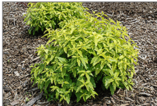
Sunshine Blue Caryopteris

Sunshine Blue Caryopteris is recommended for the following landscape applications;