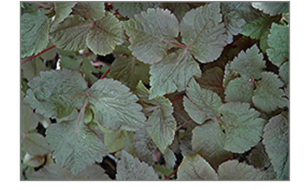
Mitsuba foliage