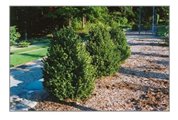
Green Mountain Boxwood

This is a relatively low maintenance shrub, and can be pruned at anytime. It is a good choice for attracting bees to your yard, but is not particularly attractive to deer who tend to leave it alone in favor of tastier treats. It has no significant negative characteristics.