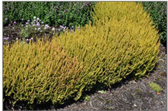
Firefly Heather

This shrub should only be grown in full sunlight. It requires an evenly moist well-drained soil for optimal growth, but will die in standing water. It is very fussy about its soil conditions and must have sandy, acidic soils to ensure success, and is subject to chlorosis (yellowing) of the foliage in alkaline soils. It is somewhat tolerant of urban pollution, and will benefit from being planted in a relatively sheltered location. Consider applying a thick mulch around the root zone in winter to protect it in exposed locations or colder microclimates. This is a selected variety of a species not originally from North America.