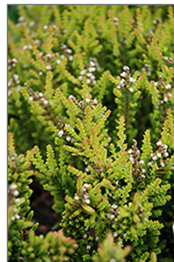
Firefly Heather foliage