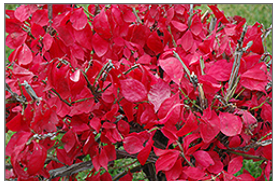
Compact Winged Burning Bush in fall