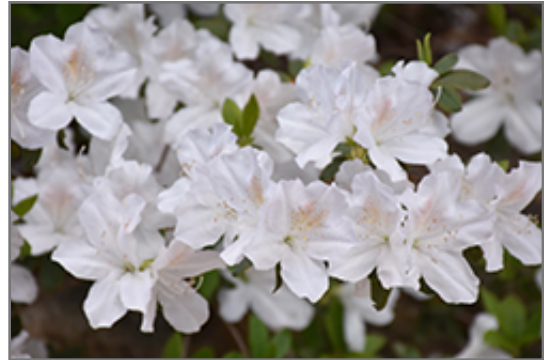
Delaware Valley White Azalea flowers