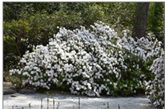
Delaware Valley White Azalea in bloom