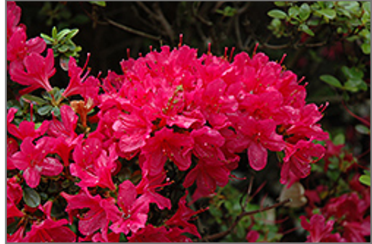
Hino Crimson Azalea flowers

This shrub does best in full sun to partial shade. You may want to keep it away from hot, dry locations that receive direct afternoon sun or which get reflected sunlight, such as against the south side of a white wall. It requires an evenly moist well-drained soil for optimal growth, but will die in standing water. It is very fussy about its soil conditions and must have rich, acidic soils to ensure success, and is subject to chlorosis (yellowing) of the foliage in alkaline soils. It is somewhat tolerant of urban pollution, and will benefit from being planted in a relatively sheltered location. Consider applying a thick mulch around the root zone in winter to protect it in exposed locations or colder microclimates. This particular variety is an interspecific hybrid.