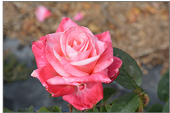
First Prize Rose flowers