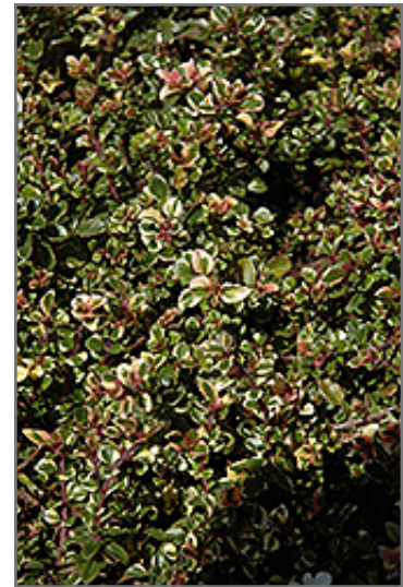
Variegated Broadleaf Thyme foliage

Variegated Broadleaf Thyme is smothered in stunning spikes of lilac purple flowers with white overtones rising above the foliage from early to mid summer, which emerge from distinctive burgundy flower buds. Its attractive fragrant round leaves remain green in color with showy creamy white variegation throughout the year.