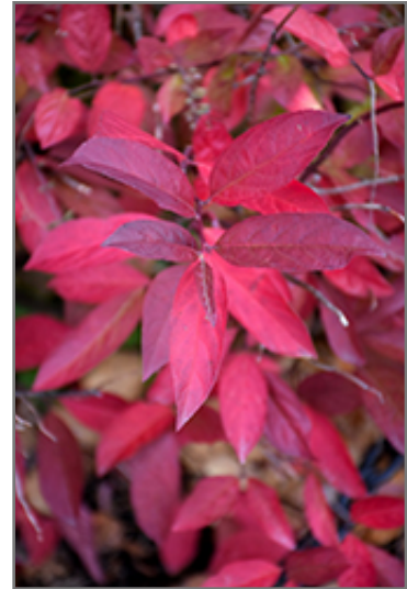
Henry's Garnet Virginia Sweetspire in fall

This shrub performs well in both full sun and full shade. It is an amazingly adaptable plant, tolerating both dry conditions and even some standing water. It is not particular as to soil type or pH. It is somewhat tolerant of urban pollution. This is a selection of a native North American species.