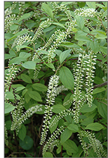
Henry's Garnet Virginia Sweetspire flowers