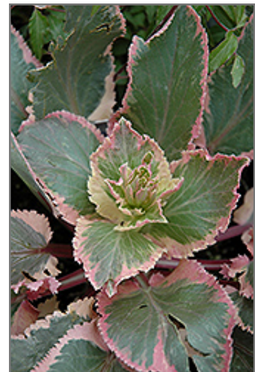
Jade Frost Variegated Sea Holly foliage