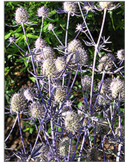
Jade Frost Variegated Sea Holly flowers

Jade Frost Variegated Sea Holly will grow to be about 8 inches tall at maturity extending to 24 inches tall with the flowers, with a spread of 15 inches. When grown in masses or used as a bedding plant, individual plants should be spaced approximately 12 inches apart. Its foliage tends to remain low and dense right to the ground. It grows at a medium rate, and under ideal conditions can be expected to live for approximately 10 years. As an herbaceous perennial, this plant will usually die back to the crown each winter, and will regrow from the base each spring. Be careful not to disturb the crown in late winter when it may not be readily seen!