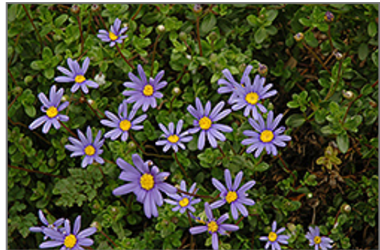
Blue Daisy flowers