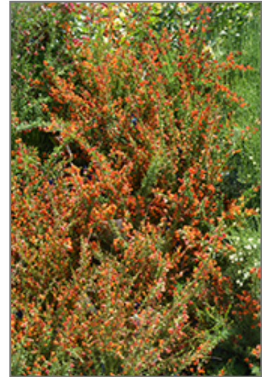
Lena Scotch Broom in bloom

This shrub should only be grown in full sunlight. It prefers dry to average moisture levels with very well-drained soil, and will often die in standing water. It is considered to be drought-tolerant, and thus makes an ideal choice for xeriscaping or the moisture-conserving landscape. It is particular about its soil conditions, with a strong preference for clay, alkaline soils, and is able to handle environmental salt. It is highly tolerant of urban pollution and will even thrive in inner city environments. This particular variety is an interspecific hybrid.