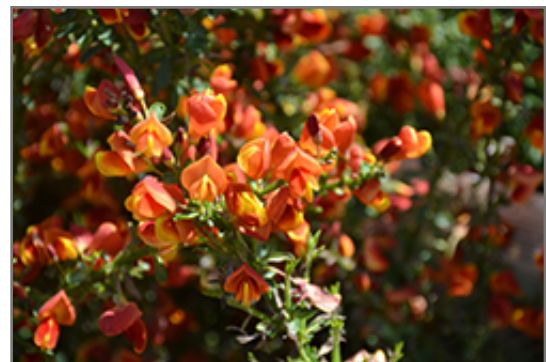
Lena Scotch Broom flowers