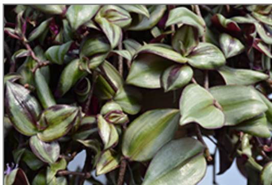
Wandering Jew foliage

Wandering Jew is recommended for the following landscape applications;