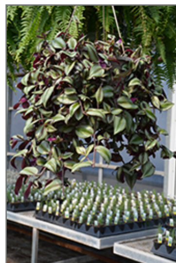
Wandering Jew