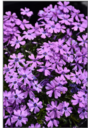
Purple Beauty Moss Phlox flowers