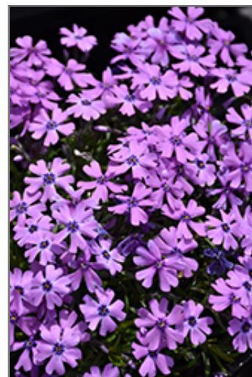
Purple Beauty Moss Phlox flowers