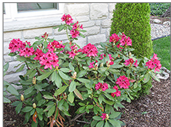
Nova Zembla Rhododendron in bloom