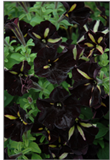
Phantom Petunia flowers