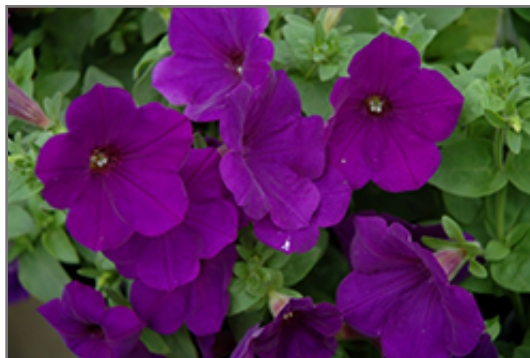
Supertunia Royal Velvet Petunia flowers

Supertunia Royal Velvet Petunia is recommended for the following landscape applications;