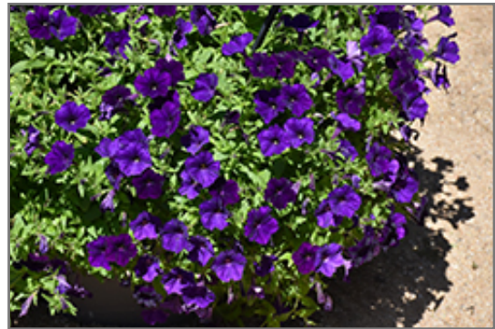
Supertunia Royal Velvet Petunia flowers

Supertunia Royal Velvet Petunia will grow to be about 10 inches tall at maturity, with a spread of 24 inches. When grown in masses or used as a bedding plant, individual plants should be spaced approximately 20 inches apart. Its foliage tends to remain low and dense right to the ground. This fast-growing annual will normally live for one full growing season, needing replacement the following year.