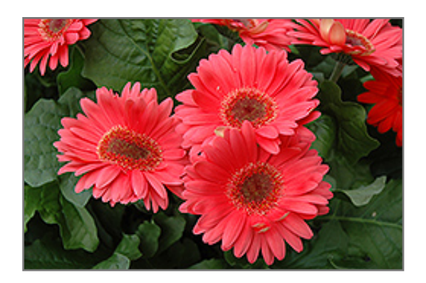
Coral Gerbera Daisy flowers