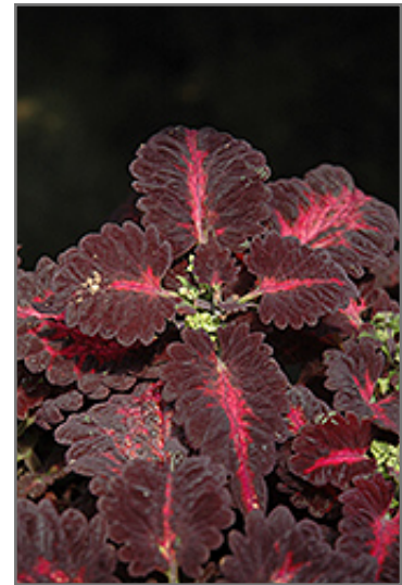
Black Dragon Coleus foliage