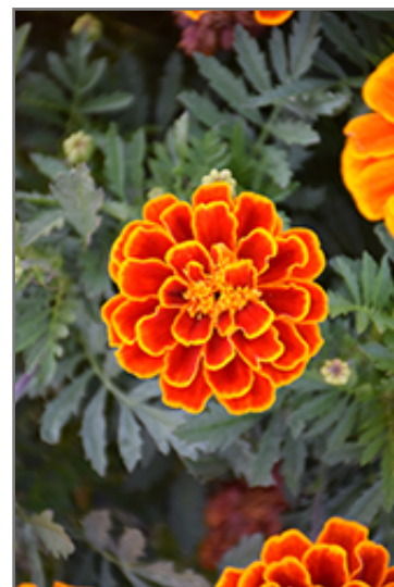
Durango Flame Marigold flowers